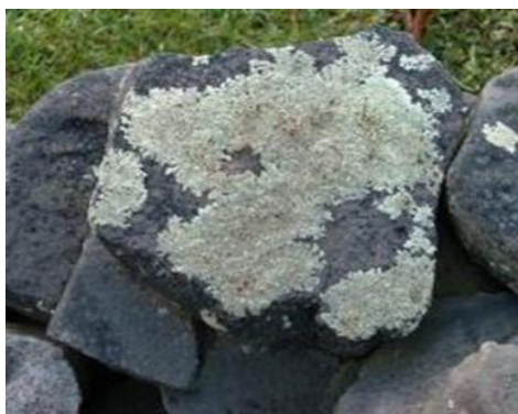
Fig. 1. X. stenophylla lichen on the rock at the sampling site.

Collection of lichen samples. Samples of X. stenophylla crustose saxicolous lichen were collected from Gegharkunik Province of Armenia, near Norashen village (40°52'06.9"N 45°27'09.8"E, altitude 1928 m AMSL) (Fig. 1). Sampling was held from September to October 2018. The sampling site was chosen considering the high humidity and high altitude of area, which promoted rapid growth of lichens. The herbarium of lichen thalli is currently maintained at the Department of Biochemistry, Microbiology and Biotechnology of YSU.