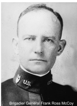
Brigadier General Frank Ross McCoy

US NA, RG 256, 184.021/140/Encl.3, M820, Reel 230, vol.204, NAA, MR 2