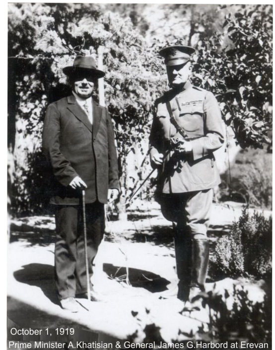
October 1, 1919 Prime Minister A. Khatiasian & General James G. Harbord at Erevan

We arrived at Etchmiadzin, the home of the Armenian Catholicos [Gevorg V] or