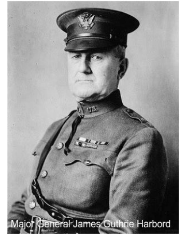
Major General James Guthrie Harbord

The U.S. President Woodrow Wilson assented that his country should allot regiments and money to establish a new semi-independent unit of multiethnic pattern. Besides, he always mentioned that his point of view would pass the