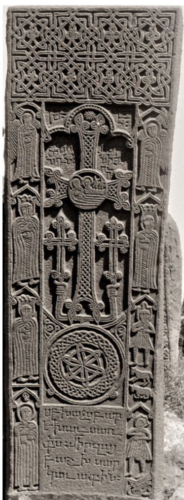
Figure 11 (right) Nativity cycle (The manger, Angels, Three magi, Shepherds), khachkar. 1558. Julfa. Aram Vruyr's archive, Service for the protection of historical environment and cultural museum-reservations, https://escs.am/am , Ministry of Education, Science, Culture and Sport of RA, digitized by Julfa cemetery repatriation digital project. © Aram Vruyr, 1915