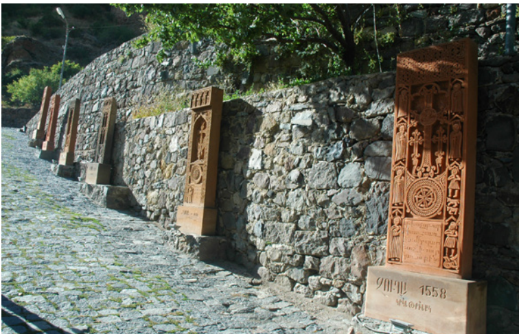
Figure 16 Replicas on Julfa khachkars, Gyumri.