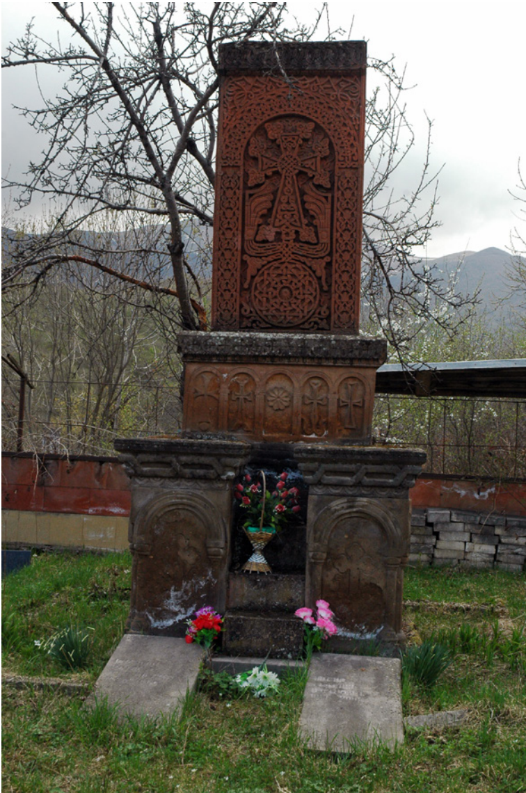
Figure 14 Replica of Tute Khachkar. 1970. Master Edik Harutyunyan, Avetaranots, Artsakh. © Author, 2012