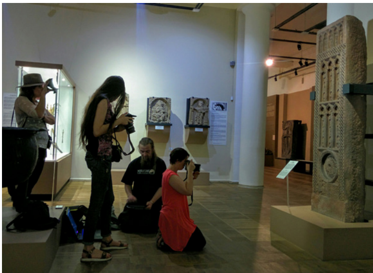
Figure 20 The Julfa cemetery repatriation digital project team at the digitizing work in the State museum of history of Armenia, 29 May 2016.

We have fought very hard to restore Julfa cemetery in light, with a view to making Azerbaijan accountable for their act of vandalism in 2006, which robbed all Armenians of their cultural heritage. We have accumulated a vast archive of photographic evidence and have presented exhibitions of the cemetery, as a 15 m 3D visualisation, in Rome. We have risked our lives to get precious photographs of the Julfa site in Azerbaijan and have travelled across the Caucasus to gather almost every existing photograph of Julfa cemetery. We have photographed every surviving stone. Our goal of creating a huge 3D reconstruction of the cemetery and using it as proof of cultural genocide against Armenians to the world is not achievable without support. I want to thank everyone who has contributed to this project, especially our Armenian supporters. I would like to ask our friends in the Armenian apostolic church to pray for a miracle. 4