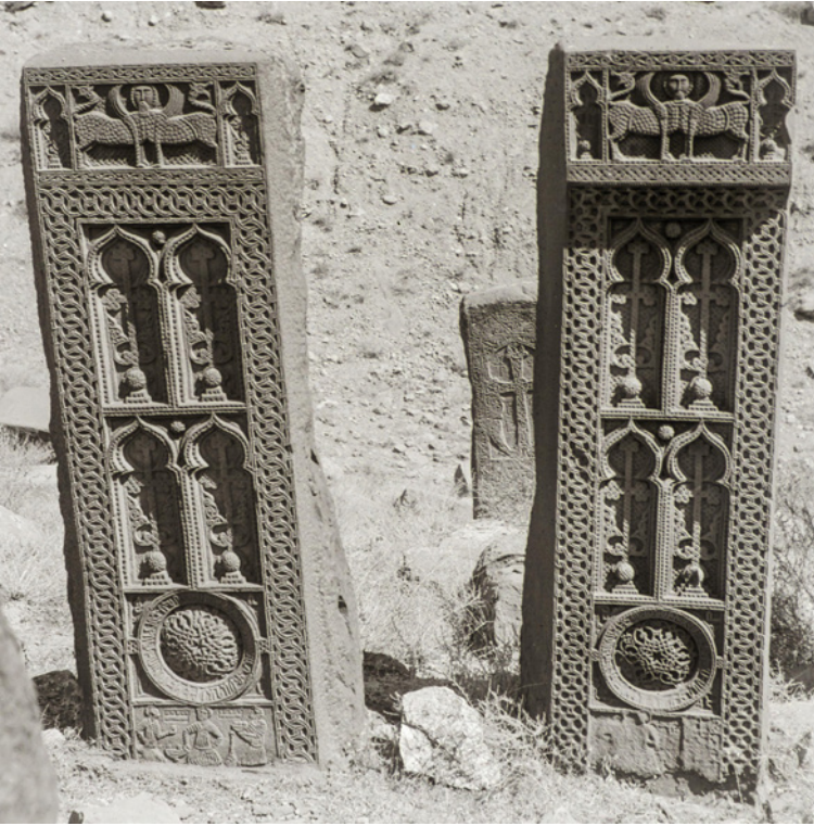
Figure 7 Khachkars. 1588. Julfa. Aram Vruyr's archive, Service for the protection of historical environment and cultural museum-reservations, https://escs.am/am , Ministry of Education, Science, Culture and Sport of RA, digitized by Julfa cemetery repatriation digital project. Photo by Aram Vruyr, 1915

At the same time, Julfa khachkars are not creations in isolation. The distinct composition division into cornice, niche, rosette (and sometimes scenes with human beings), for example, is a standard feature for khachkars from the fifteenth and seventeenth centuries with one exception: Julfa khachkars make a vibrant architectural statement. The same can be said about a number of decorations: the use of small crosses and stars as well as the absorbing of rosette in the slab are commonplace. But in Julfa's case, their use is more expressive, symmetric, and perfect. There are unique Julfa decorations as well, such as acanthus blossoms enclosed in trefoil arches that along with oval blossoms border the edges and sometimes the cornice; and of course, the lancet shape arches show absolutely new architectonic feature [figs. 5-7], borrowing from Muslim or even European architecture.