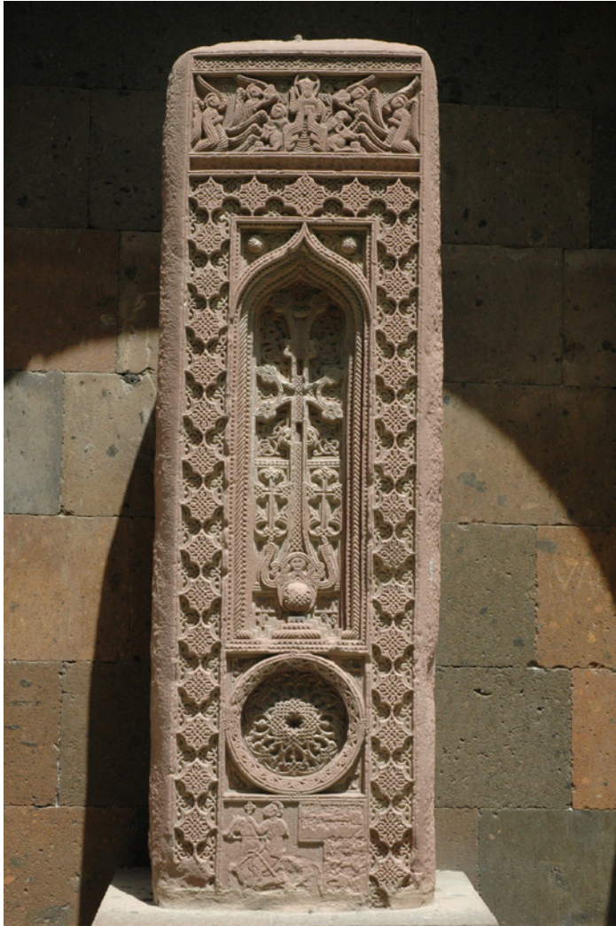
Figure 5 Khachkar. 1602. Julfa. Master Grigor, now in Holly See Echmiadzin.