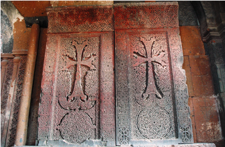
Figure 1 Medieval cemetery with khachkaras, 12-17th cc, Arinj, Kotayk province.