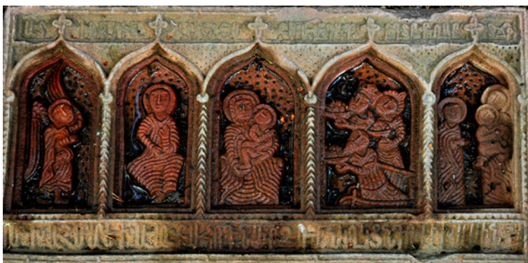
Figure 10 Nativity cycle (Annunciation, Maria with Jesus, Three magi, Presentation of Jesus at the Temple), khachkar's conice. 1602. Masters Grigor and Sargis, Julfa, now in Tbilisi Open Air Museum of Ethnography.