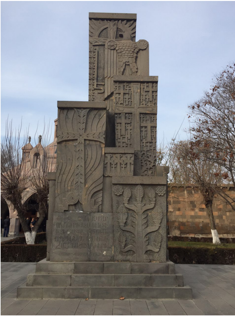
Figure 13 Khachkar on memory of Genocide. 1965. Author Raphael Israelyan, Holly See Echmiadzin. © Author, 2019