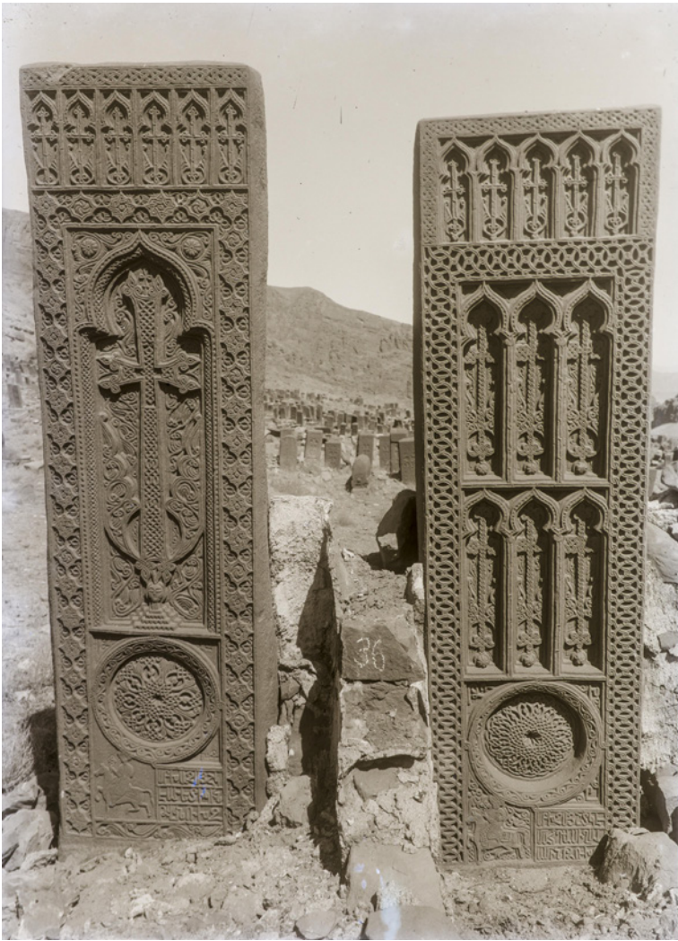
Figure 6 Khachkars. 1597, 1599. Julfa. Aram Vruyr's archive, Service for the protection of historical environment and cultural museum-reservations, https://escs.am/am . Ministry of Education, Science, Culture and Sport of RA, digitized by Julfa cemetery repatriation digital project. Photo by Aram Vruyr, 1915