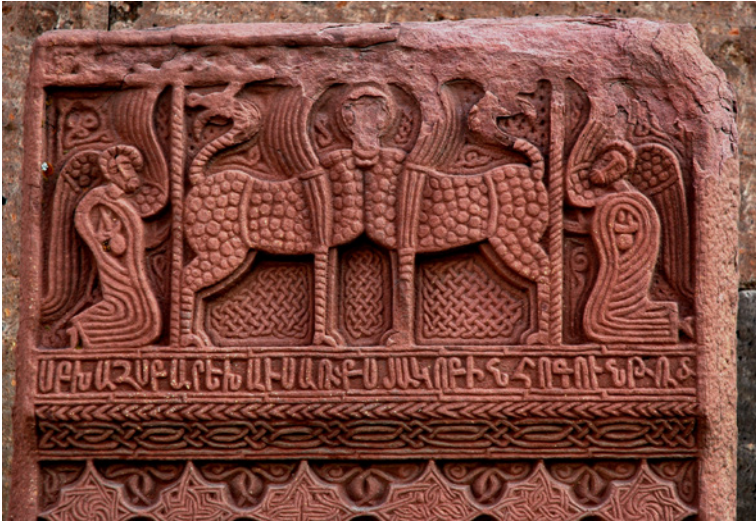
Figure 9 The Sphinx , khachkar's cornice. 1601. Julfa, now in Holly See Echmiadzin.