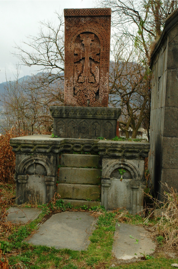
Figure 15 Khachkar of Tute. 1184. Sanahin monastery, Lori province.